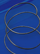
Conical helical compression spring