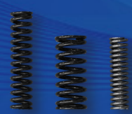
Cylindrical helical compression spring