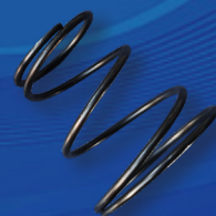
Cylindrical helical compression spring