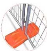
Can be used multiple times

Column: Square tube Round tube Peach column New anti-theft column Round tube is the most common