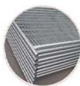
Flexible and easy to move