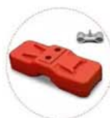
Easy to install