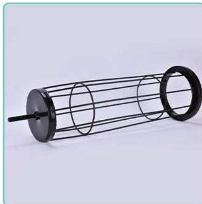
Silicone bag cage frame