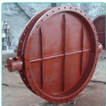
Ventilation butterfly valve