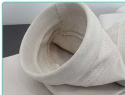
Glass fiber expanded film bag