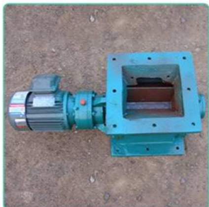
YJD-H type star unloader

If you are interested in our dust removal accessories or have any questions, please feel free to contact us, we will communicate with you immediately after receiving your message!