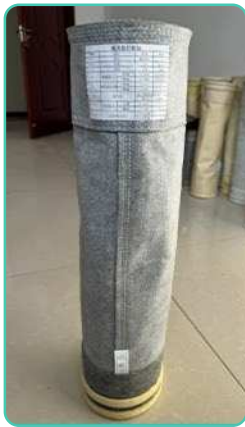
Flumes dust bag