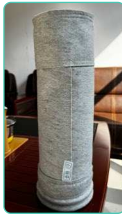
Basalt needle felt dust bag