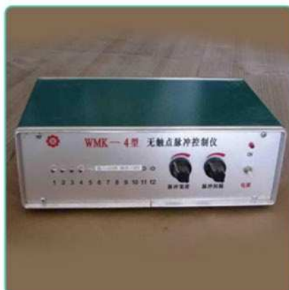
Contactless pulse controller