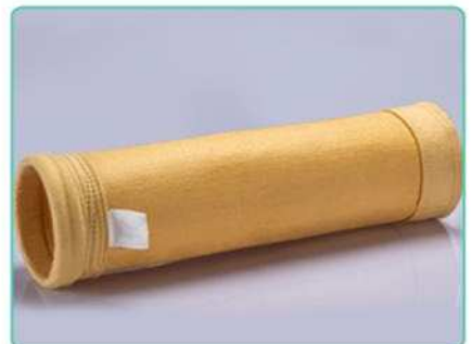
Fiberglass needle felt filter bag