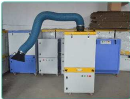
Single arm welding fume purifier