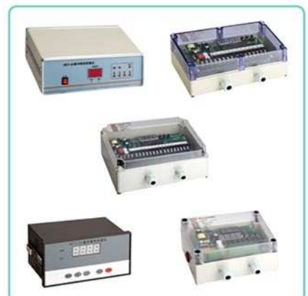
Pulse valve controller