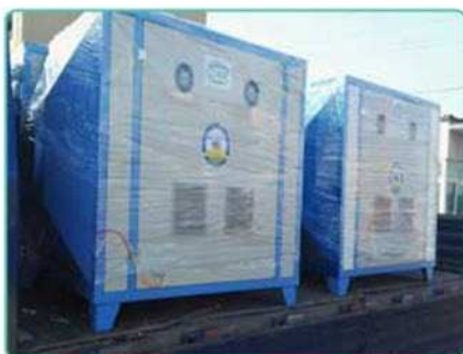
Plasma oil fume purifier