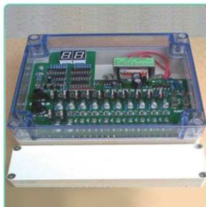
Round dust bag cage frame