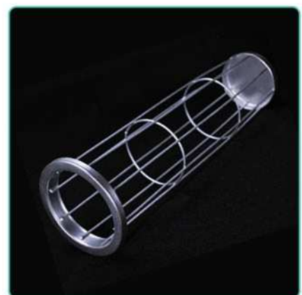
Round dust bag cage frame