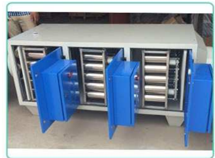
Oil fume purifier