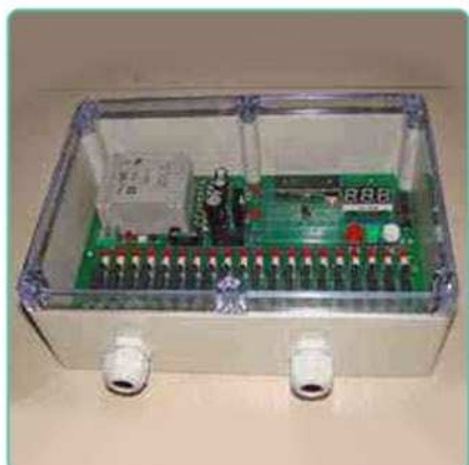
ZNKZ type pulse controller