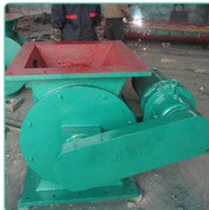
Chain drive unloader