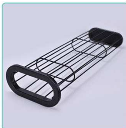
Flat bag dust collector frame