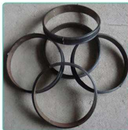
Dust removal circle