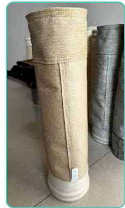
Acrylic dust bag