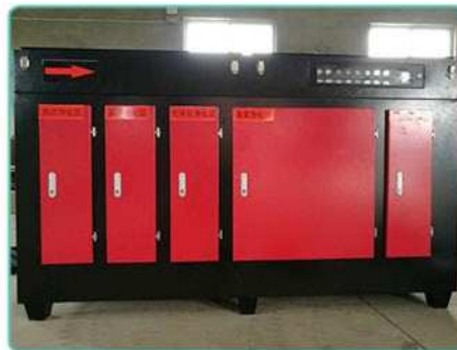
Photooxygen exhaust gas purifier