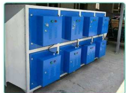
Low temperature plasma air purifier