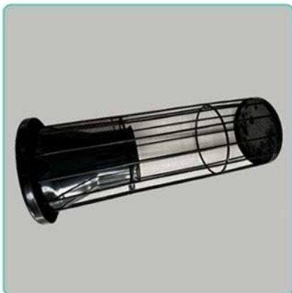
Dust removal skeleton