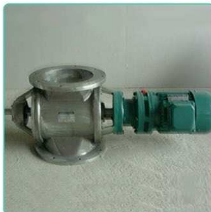
Stainless steel unloader