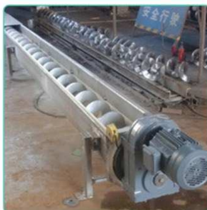
GX type fixed screw conveyor