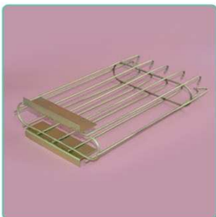
Flat bag dust collector frame