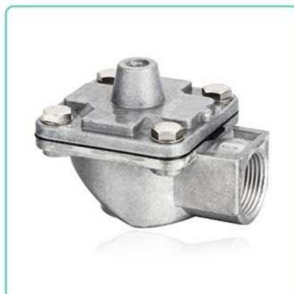
Air controlled type