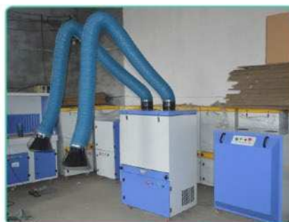
Double arm welding smoke purifier