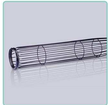
Silicone bag cage frame